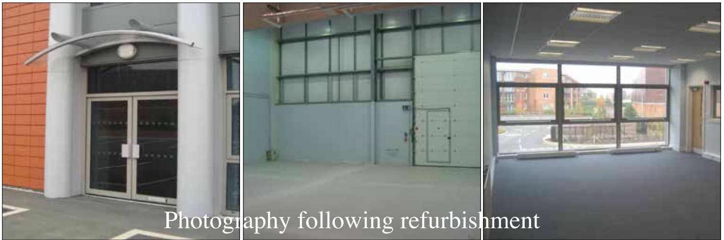
Photography following refurbishment