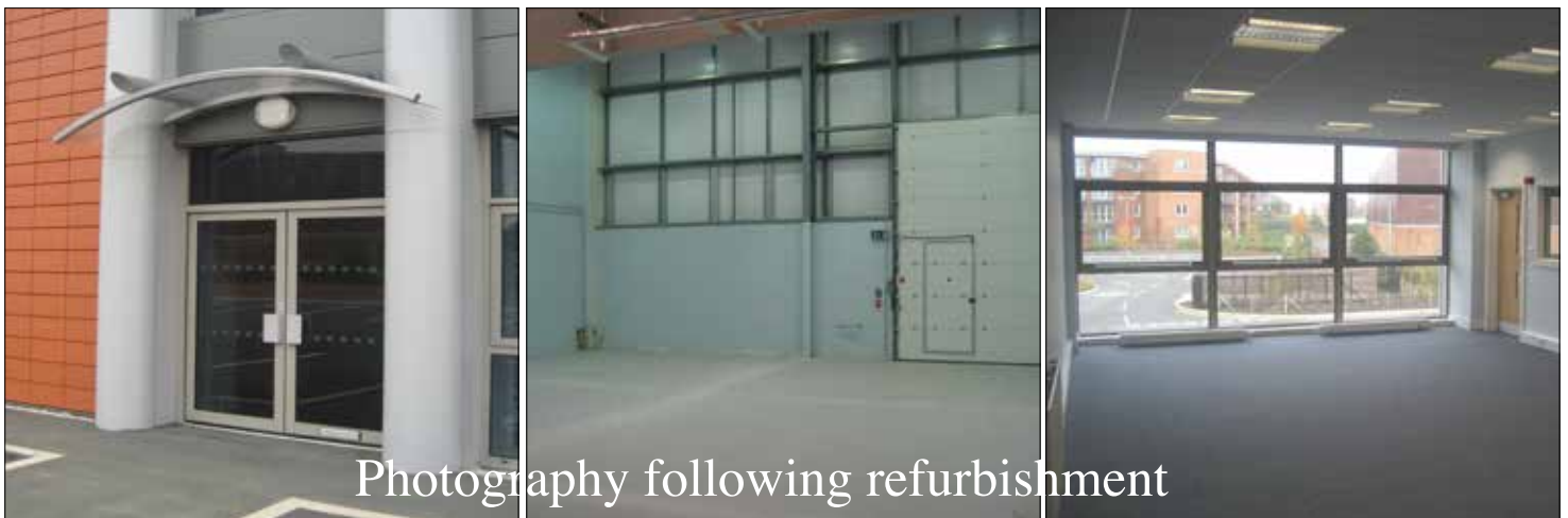
Photography following refurbishment