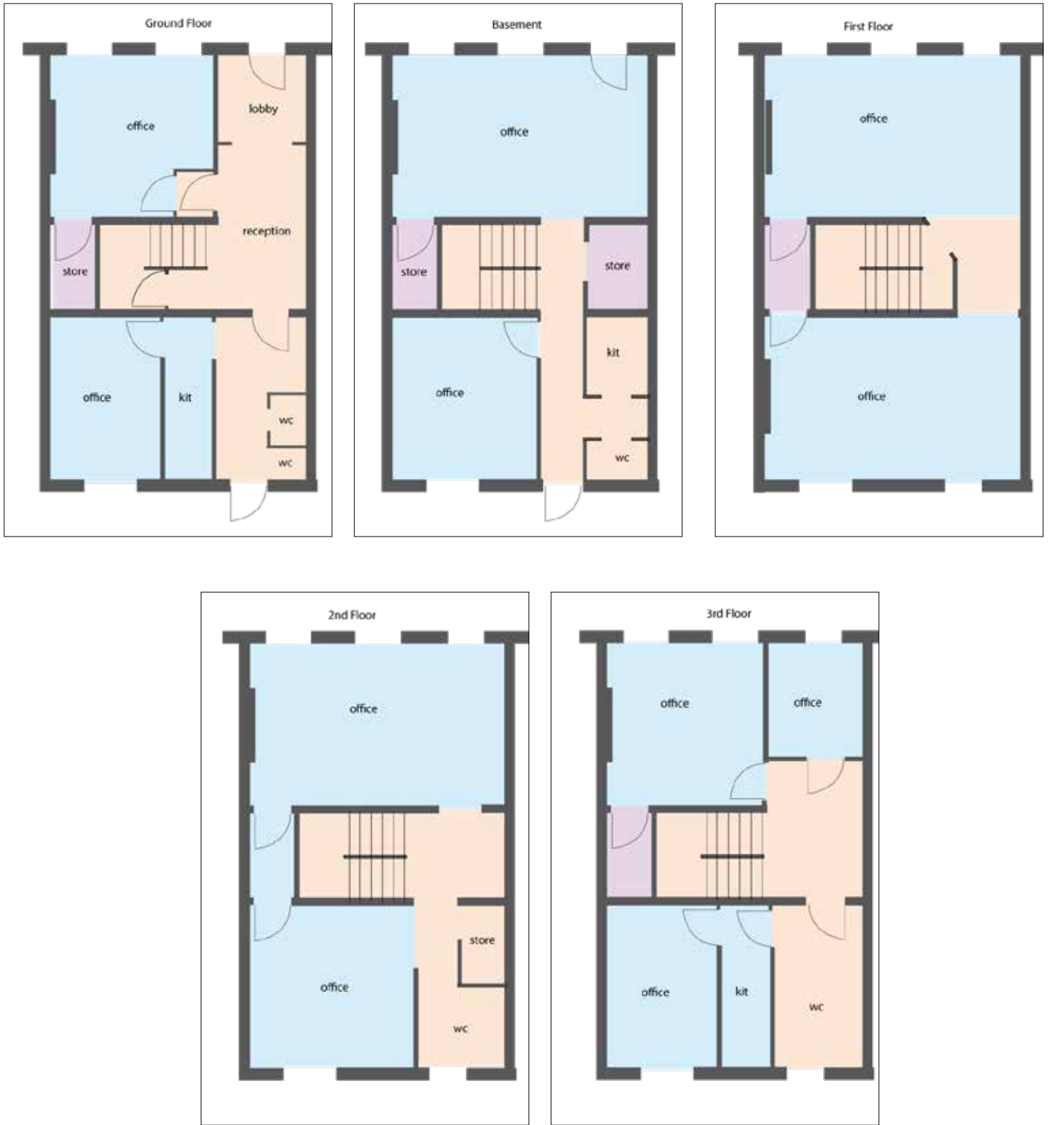
Internal Floor Plans